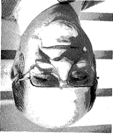
Honorable Merino Romoli, Jr.